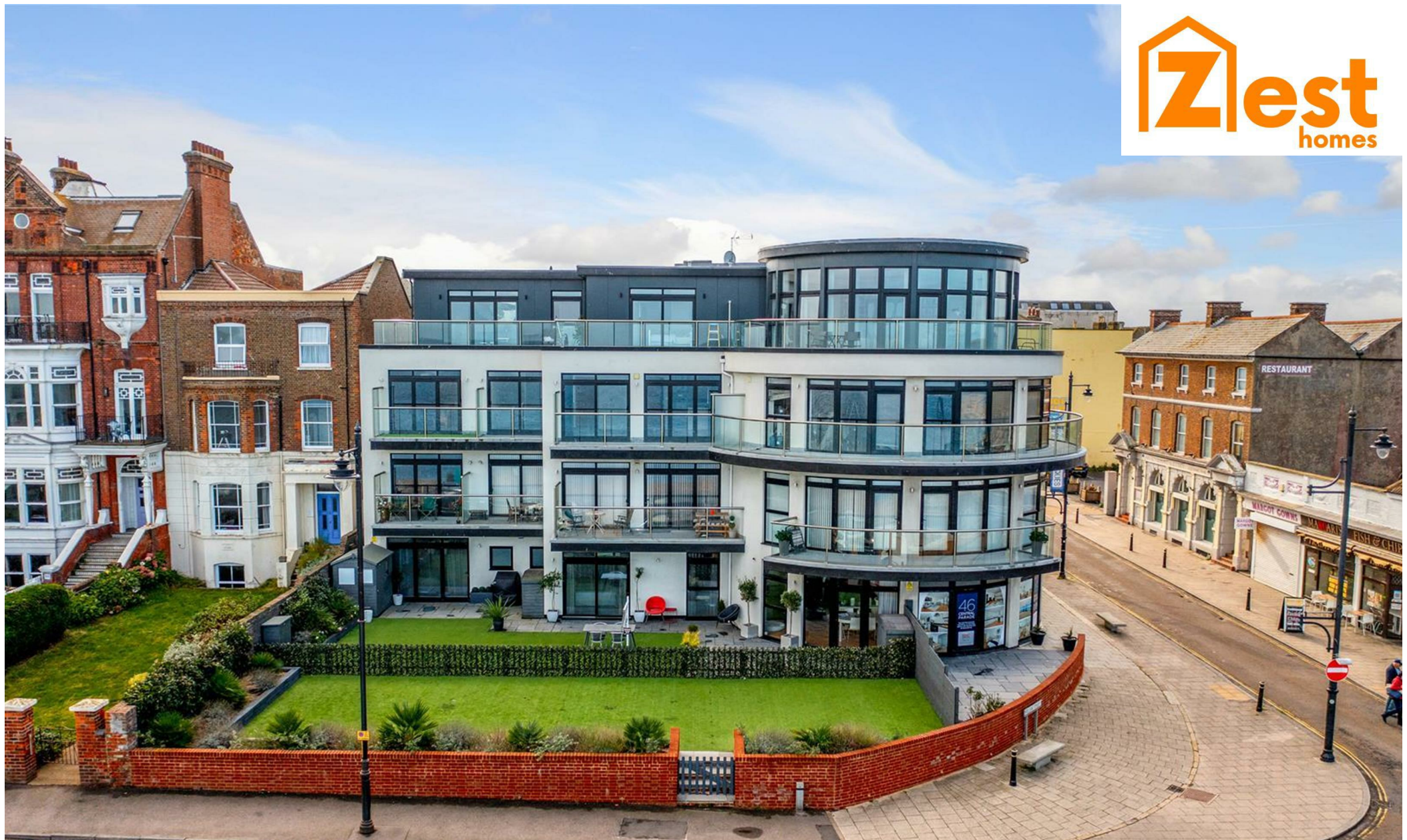
3 Bun Penny Apartments William Street, Herne Bay, CT6 5EW £375,000